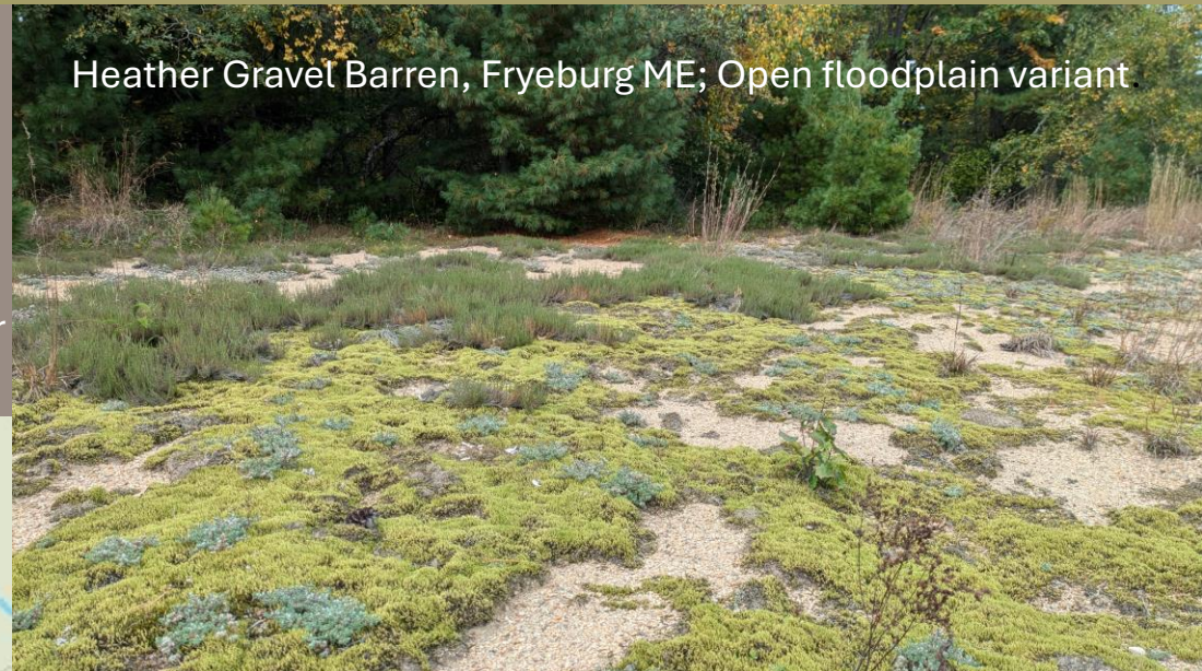
Heather Gravel Barren, Fryeburg ME; Open floodplain variant

Climate Change is primary threat: More frequent severe rain events resulting in higher river flows