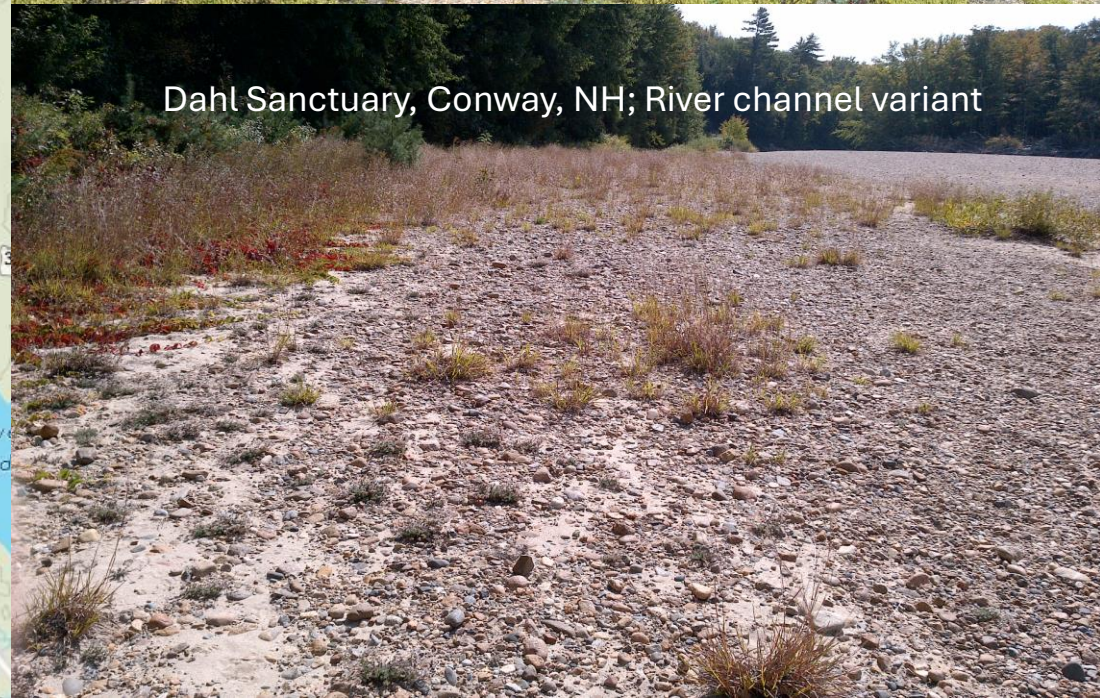
Dahl Sanctuary, Conway, NH; River channel variant