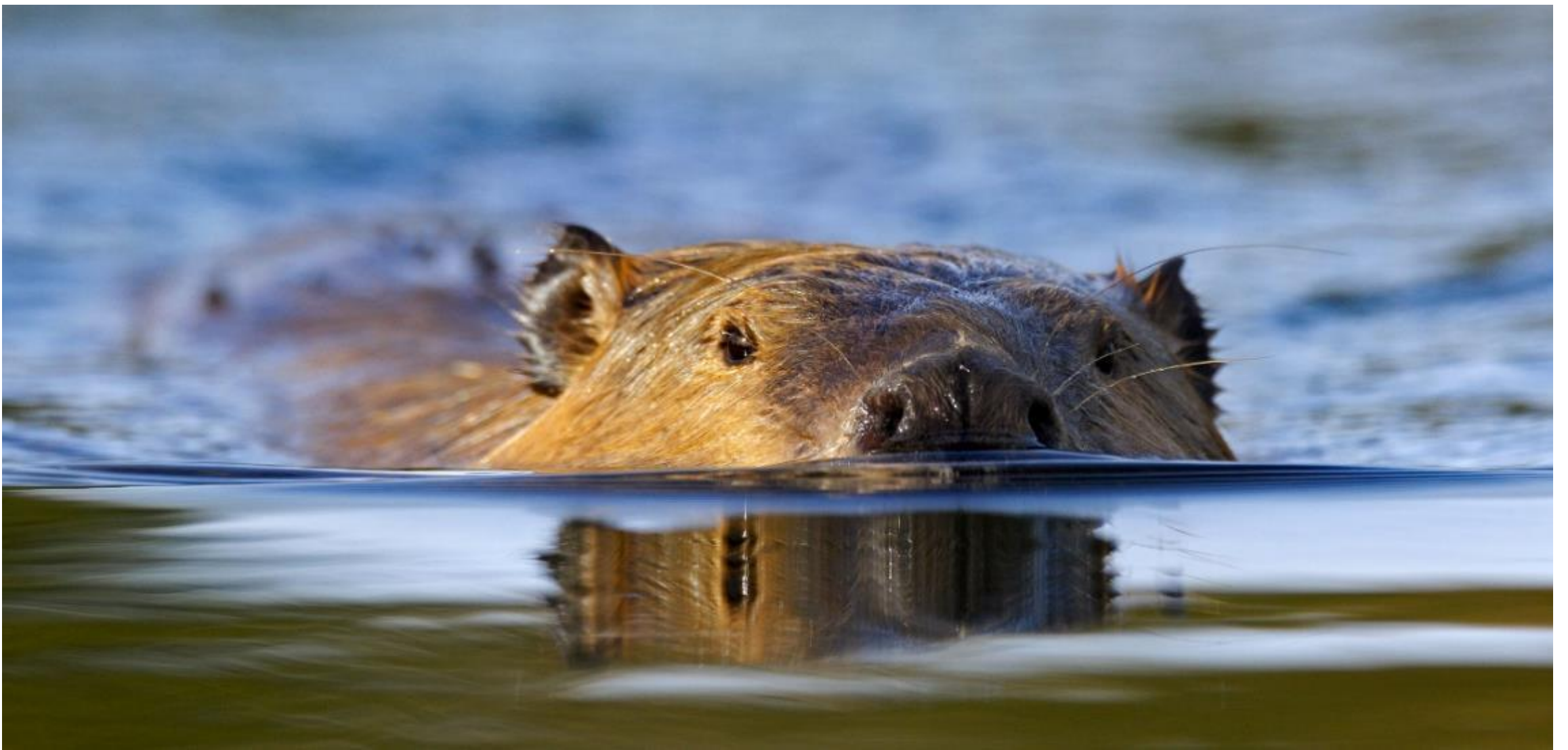
Brian Bangs, Aquatic Ecologist, US Fish and Wildlife Service, Ecological Services Oregon Fish and Wildlife Office, Aquatic Resources Division