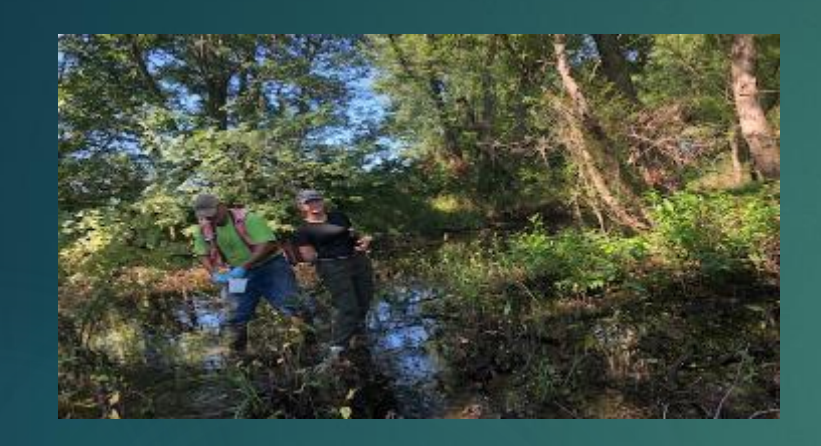
Wetland Program Coordinator