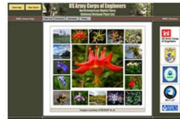
A presentation given during a webinar.