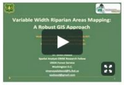
Part 2: Sinan A. Abood, USDA Forest Service