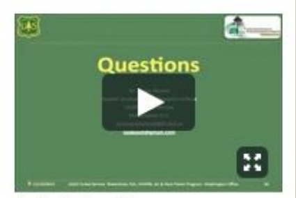
Part 4: Questions