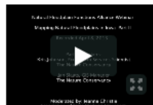
Part 3: Questions & Answers