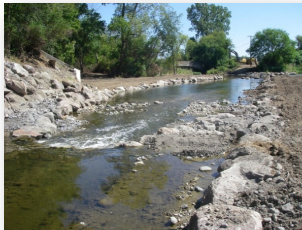
Site of recent dam removal in Michigan showing channel and riparian habitat restoration