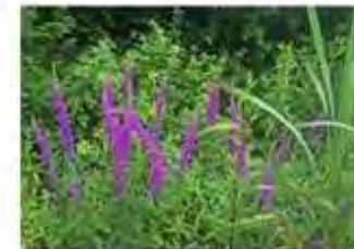
Jeanne Christie Photo

For information about this picture and to see past pictures of the week click here .