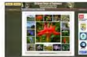
A presentation given during a webinar

If you haven't used Go To Webinar before or you just need a refresher, please view our guide prior to the webinar here.