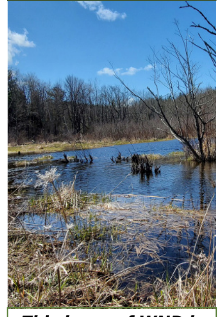
This issue of WND is sponsored by