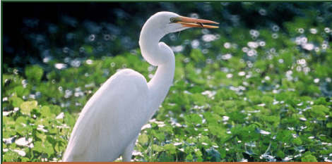
Wetland News Digest